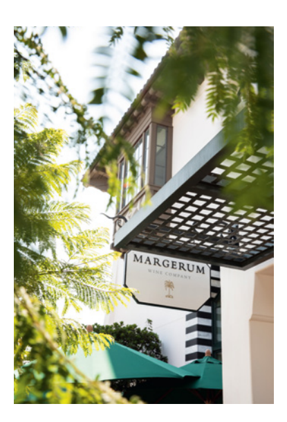
FUNK ZONE, SANTA BARBARA